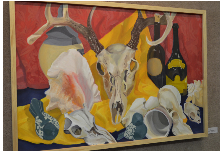
“ Capitibus, Conchis, et Ures ” (Latin for “Skull, Shell, and Bottle”)